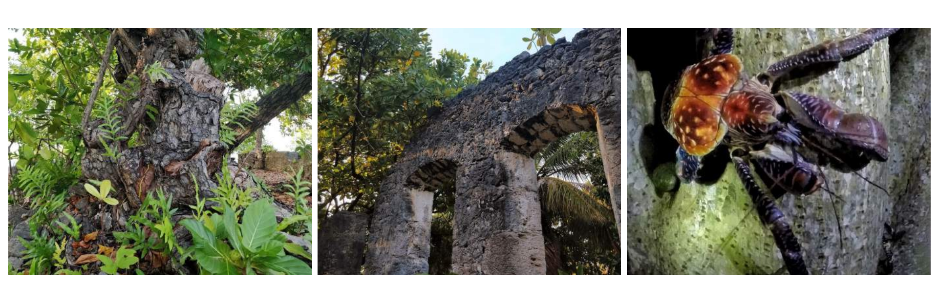
Day 3: An early departure for Fakarava Village. It is possible to hire electric bikes to cycle up the coast, stopping at a pearl farm, or a swim along the way. After lunch onboard, we depart for Toau, dropping anchor just off Coconut Crab Motu that must be explored after dark.